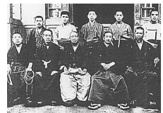
An early gathering of Judo and Jujutsu leaders -- Jigoro Kano is seated third from the right